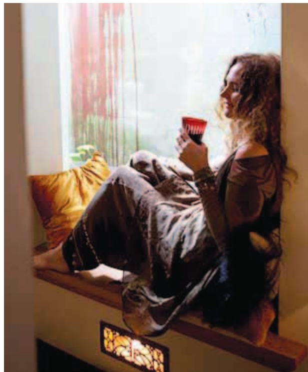
TOP LEFT: 'Walter's Family' sculptures, $1500, by Walter Auer at Tibet Sydney. Copper lantern, $95, and pillar candle, $5, Orson & Blake. TOP RIGHT: The Servery & Soup Station ceramic birds, $25 each, Terrace. Breville single hot plate, $68.97, Big W. 'Microstoven' 6.5L casserole, $129.95, Maxwell & Williams. Etched glass tumblers, $15 each, Orson & Blake. Beige floral bowls, $57 medium, Ada & Darcy. BOTTOM LEFT: As previous pages. Patio by Jamie Durie cast iron chiminea, $148, Big W. Extra large turquoise ginger jar, $242, floral storage jar, $89, all Ada & Darcy. Dichondra 'Silver Falls' in green pot, $45, Watermelon Peperomia in pot, $45, all Terrace. Brass vase, $120, Tibet Sydney. BOTTOM RIGHT: Ochre velvet cushion with linen back, $145, Mongolian lamb-fur cushion in ink, $120, red wine glass, $27, all Orson & Blake. Sam, as previous page. OPPOSITE: Lantern, candle and sculpture as previous pages and above. >