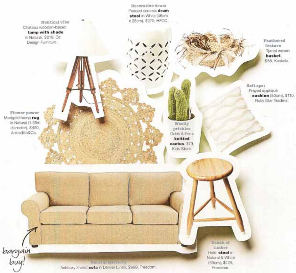
Nautical vibe Chateau wooden-based lamp with shade in Natural, $219, Oz Design Furniture.