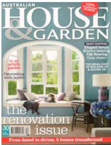
HOUSE & GARDEN - April Issue 2011