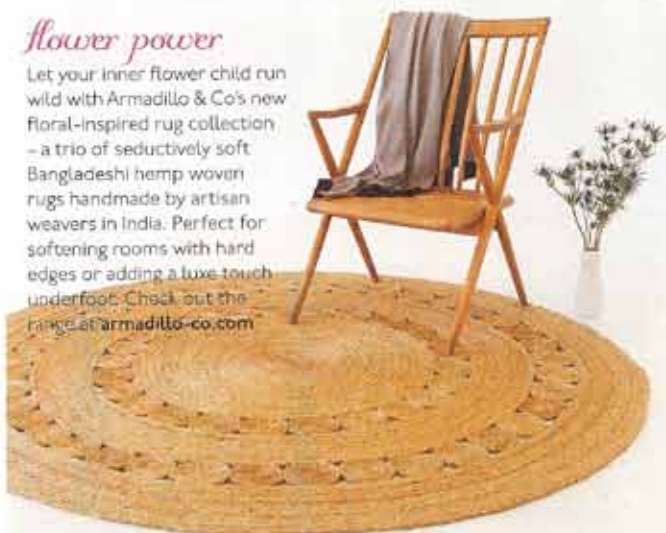
'Marigold' rug, $450/1.5m diameter, Armadillo & Co, armadillo-co.com .

Let your inner flower child run wild with Armadillo & Co's new floral-inspired rug collection – a trio of seductively soft Bangladeshi hemp woven rugs handmade by artisan weavers in India. Perfect for softening rooms with hard edges or adding a luxe touch underfoot. Check out the range at armadillo-co.com